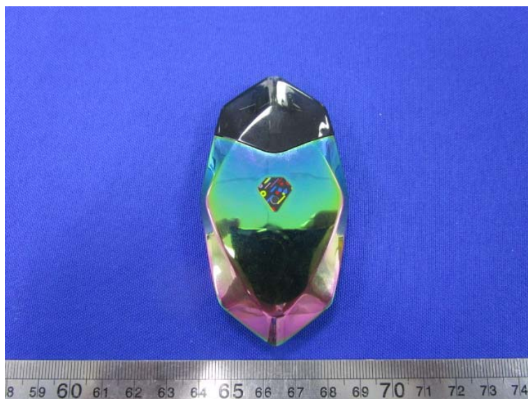
Smoant Karat pod starter kit