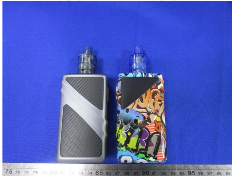
Smoant Taggerz Kit