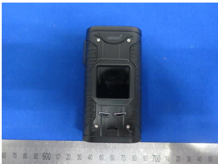
Smoant Cylon TC 218