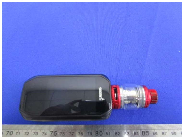
Smoant NABOO Kit